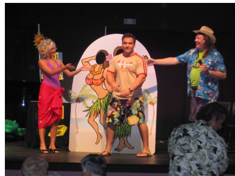
A scene from Mozart at the Beach , 2005